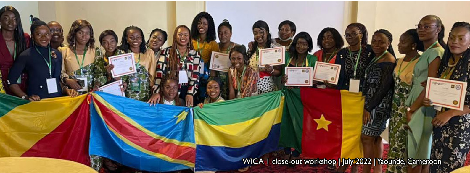
WICA I close-out workshop | July 2022 | Yaoundé, Cameroon