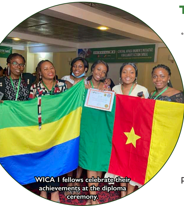
WICA I fellows celebrate their achievements at the diploma ceremony.

“With my colleagues from the DRC, we want to create a new consultancy company working on greenhouse gas management, and we also envision that we will become future mentors to the next generation of climate experts. We also want to use our new expertise in greenhouse gas accounting to help our country further develop and implement climate adaptation and mitigation programs.”