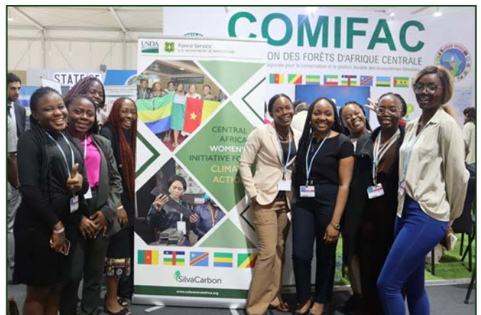
Top: WICA fellows visit IBAY SUP in Cameroon, an educational institution that specializes in environmental sciences.