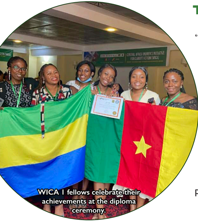
WICA I fellows celebrate their achievements at the diploma ceremony.

“With my colleagues from the DRC, we want to create a new consultancy company working on greenhouse gas management, and we also envision that we will become future mentors to the next generation of climate experts. We also want to use our new expertise in greenhouse gas accounting to help our country further develop and implement climate adaptation and mitigation programs.”